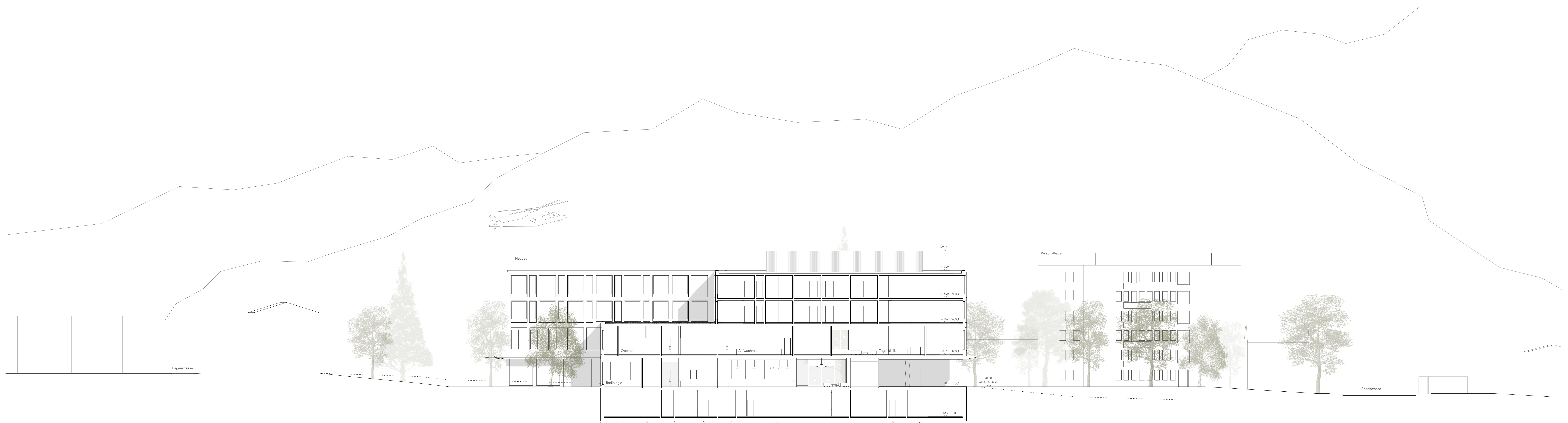
Schnitt B 1:200